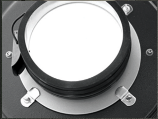
"Rigid Clips" for use with all flat base speed rings, Profoto D1 and Calumet Traveler series.