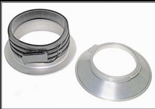
This image shows just the speed rings inserts, which can be purchased separately. (Redwing)