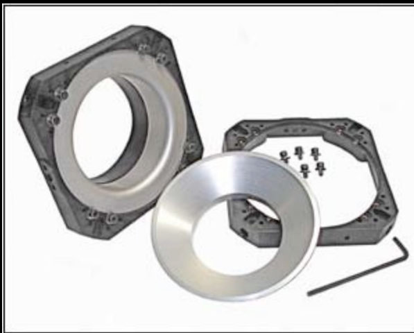
This image shows an insert removed from the molded speed ring.